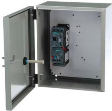
STARTER, 3RE41228CA114AY0, WITH MODS