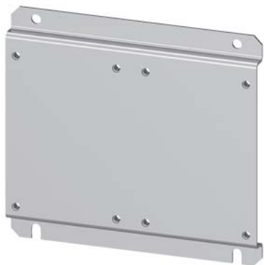
Base plate for mounting of combination of two contactors (2x 3RT1.6) for reversing