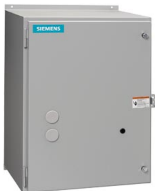
Electrically held 300Amp NEMA 4SS NON-Combination