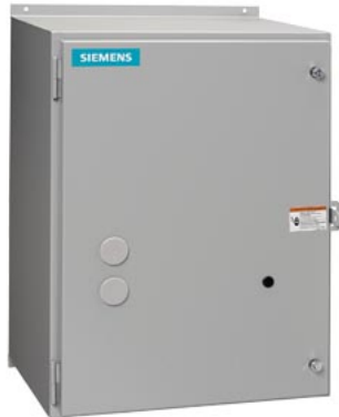
200A 3-pole NEMA 1 Electrically held 600VAC control voltage