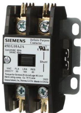
Contactor, 45DP,30A,1P,Open,120 Contactor, 45DP,30A,1P,Open,120