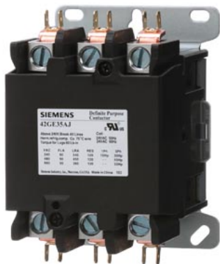
Contactor, 42DP,90A,3P,Open,480 Contactor, 42DP,90A,3P,Open,480