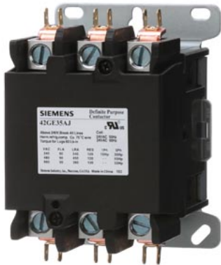
Contactor, 42DP,90A,3P,Open,240 Contactor, 42DP,90A,3P,Open,240