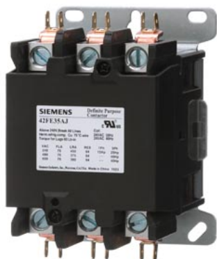
Contactor, 42DP,75A,3P,Open,277 Contactor, 42DP,75A,3P,Open,277