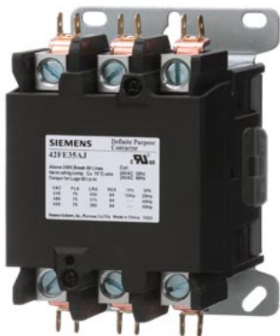
Contactor, 42DP,75A,3P,Open,24V Contactor, 42DP,75A,3P,Open,24V