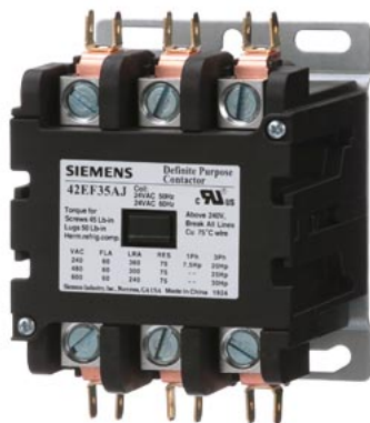
Contactor, 42DP,60A,3P,Open,24V Contactor, 42DP,60A,3P,Open,24V