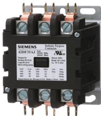
Contactor, 42DP,50A,3P,Open,480 Contactor, 42DP,50A,3P,Open,480