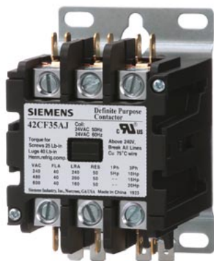
Contactor, 42DP,40A,3P,Open,480 Contactor, 42DP,40A,3P,Open,480