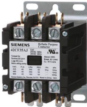
Contactor, 42DP,40A,3P,Open,120 Contactor, 42DP,40A,3P,Open,120