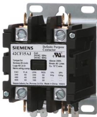
Contactor, 42DP,40A,2P,Open,24V Contactor, 42DP,40A,2P,Open,24V