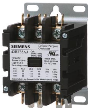
Contactor, 42DP,30A,3P,Open,24V Contactor, 42DP,30A,3P,Open,24V