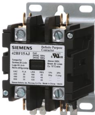
Contactor, 42DP,30A,2P,Open,277 Contactor, 42DP,30A,2P,Open,277