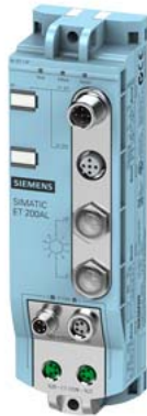
SIMATIC ET 200AL, PROFIBUS interface module IM 157-1 DP, Degree of protection IP67