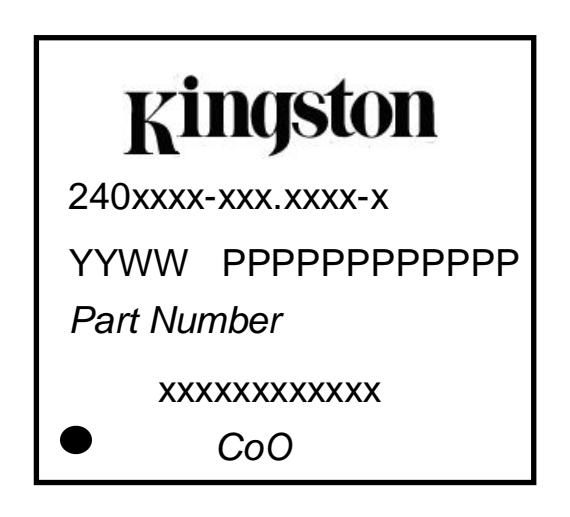
Figure 4 - EMMC Package Marking