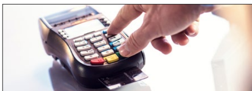
Point of Sale (POS)