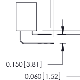
559 Contact Code

0.240 [6.10] Up to 27/54 Pin 0.162 [4.11] 28/56 and Over 0.290 [7.37] Up to 27/54 Pin .212 [5.38] 28/56 and Over