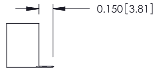
554 Contact Code