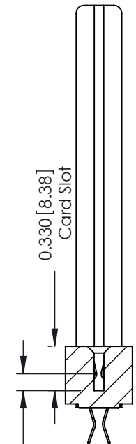
0.125 [3.18] Point of Contact SECTION A-A

See Accompanying Page for: • Mounting Options