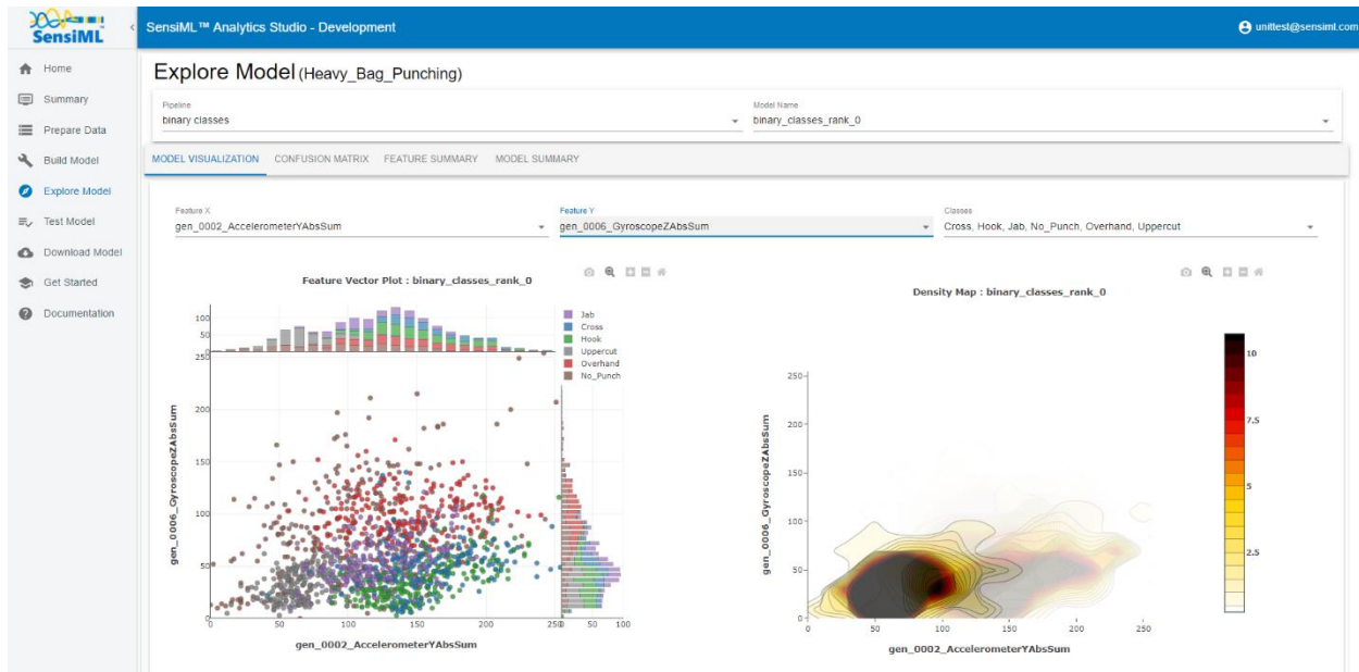
Analytic Studio GUI interface to AutoSense Pipeline

tutorials to familiarize yourself with the model building process and get up in running in no time.