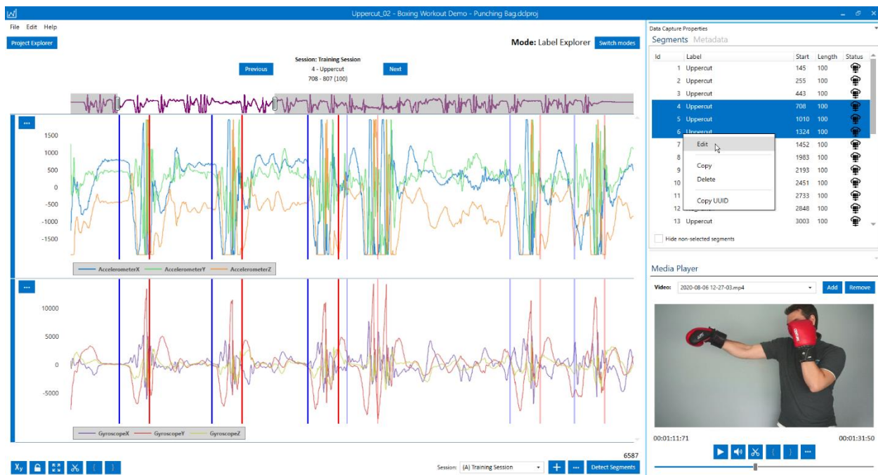
Desktop Data Capture Lab used to label and visualize raw accelerometer sensor data