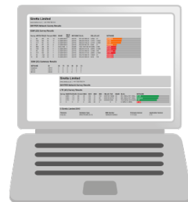
Downloaded HTML Survey Results