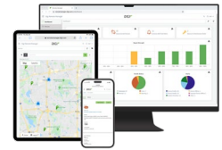
Manage and configure Digi TX40 5G with Digi Remote Manager