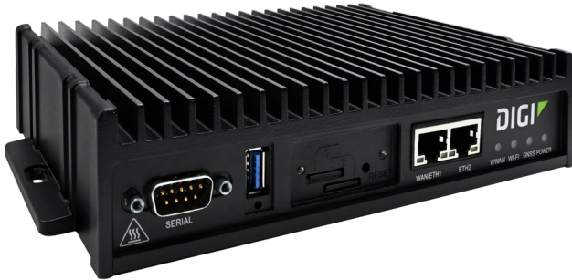
DIGI TX40 5G — FRONT