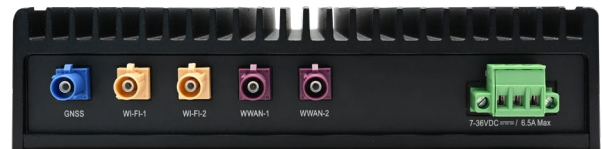
DIGI TX40 5G — BOTTOM