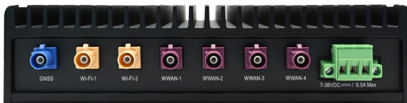
DIGI TX40 5G — TOP