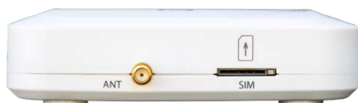
DIGI CONNECT IT MINI LEFT