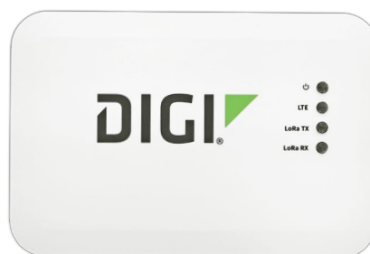
Digi HX15 Gateway — back