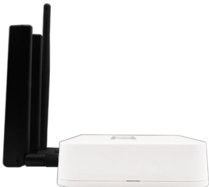
Digi HX15 Gateway — left