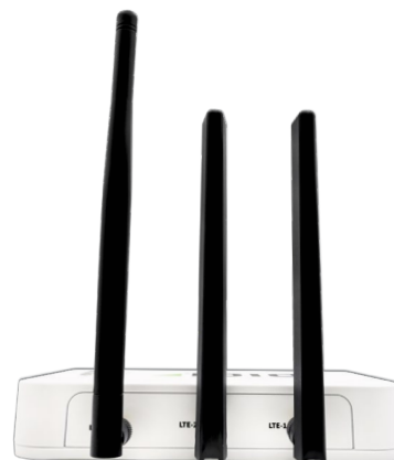
Digi HX15 Gateway — back