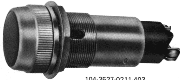
104-3527-0211-403 Flat lens

Recognized under the component program of Underwriters' Laboratories Inc.