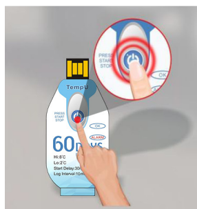
Press the button to start