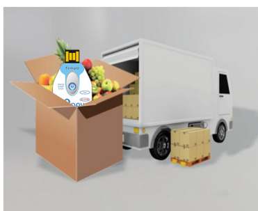
Pack into shipment