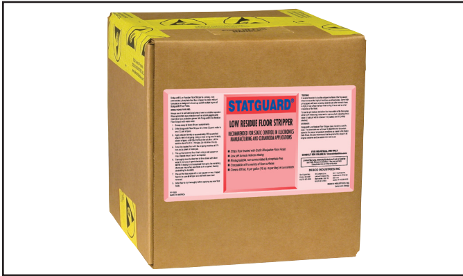
Figure 3. Statguard® Floor Stripper: 5 gallon bag-in-box

Stripping the floor is recommended for first time application of any finish. New tiles are supplied with a protective factory finish that protects during installation but should be stripped away prior to any floor finish application. Properly maintained floors should be stripped one to two times annually, depending on traffic and buildup of contaminated finish. Statguard® Floor Stripper is recommended to strip multiple layers of floor finish or coatings.