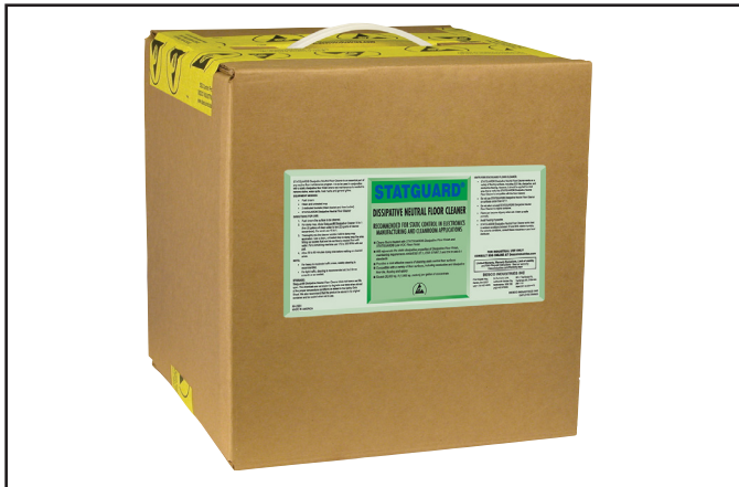
Figure 8. Statguard® Dissipative Floor Cleaner: 5 gallon bag-in-box