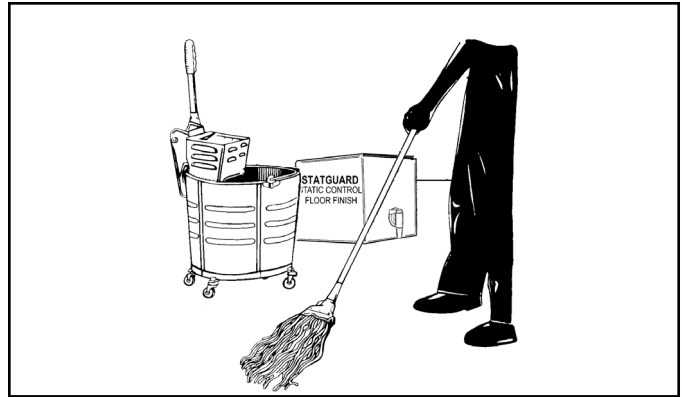
Figure 7. Applying floor finish