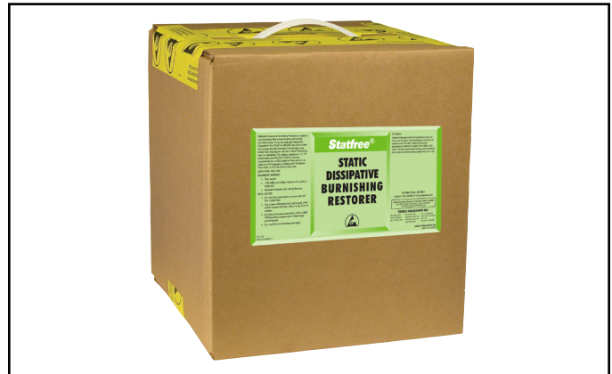
Figure 9. Statfree® Dissipative Burnishing Restorer

Additional usage information can be found in Technical Bulletin TB-7041 .