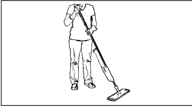
Figure 6. Applying floor finish with Flat Mop (optional).

If Statguard® Static Dissipative Floor Finish freezes, allow it to thaw to 70° F and mix completely before application.