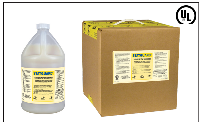
Figure 5. Statguard® Static Dissipative Floor Finish 1 gallon bottle & 5 gallon bag-in-box