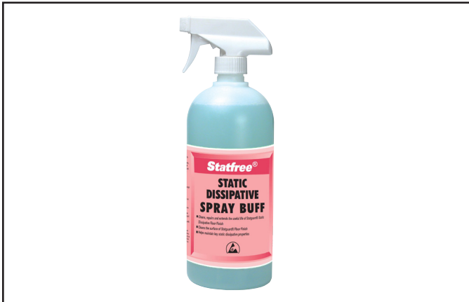
Figure 10. Statfree® Dissipative Spray Buff