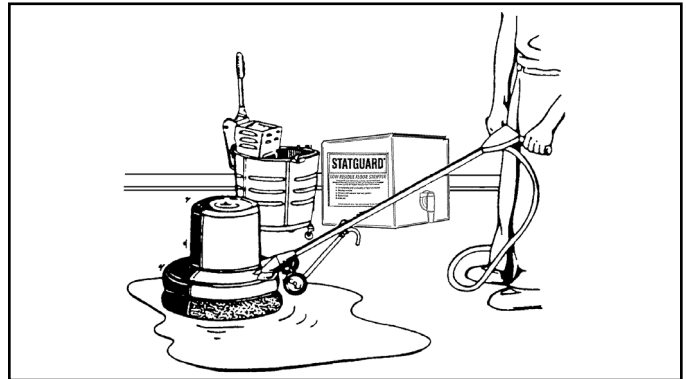
Figure 4. Stripping floor