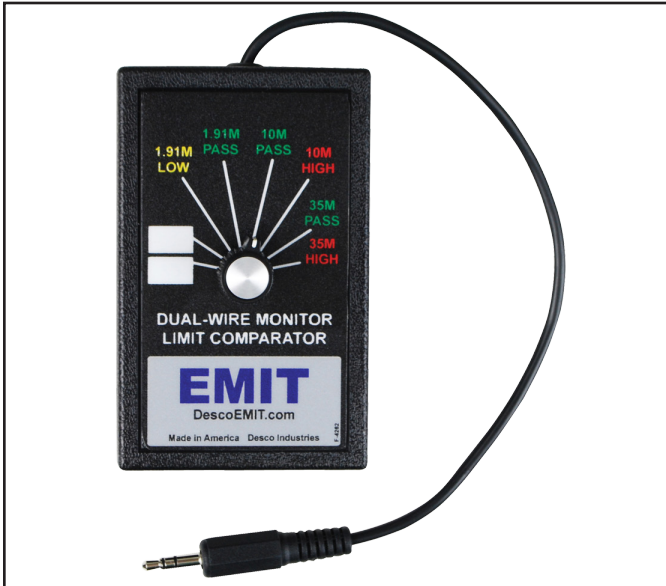
Figure 1. EMIT 50524 Limit Comparator