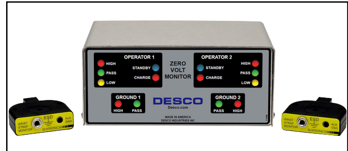
Figure 2. Desco 19668 Zero Volt Monitor