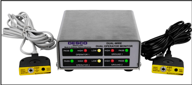
Figure 3. Desco 19662 Dual-Wire Dual Operator Monitor