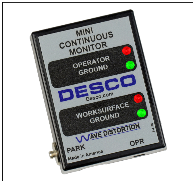
Figure 1. Desco Mini Monitor