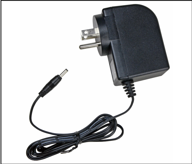
Figure 2. North American power adapter included with the 19239 and 19242 Mini Monitors