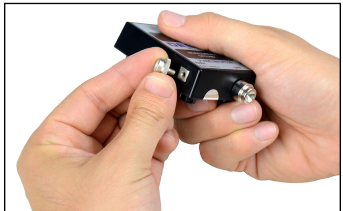
Figure 7. Changing the park snap on the 19243 Mini Monitor

The 19243 Mini Monitor includes an interchangeable 10mm park snap and 10mm banana jack adapter for operators who use wrist cords with 10mm terminations. Use the park snaps' knurled rims to unscrew the 4mm park snap from the monitor and install the 10mm park snap to the monitor. Plug the 10mm operator jack adapter into the monitor's operator jack.