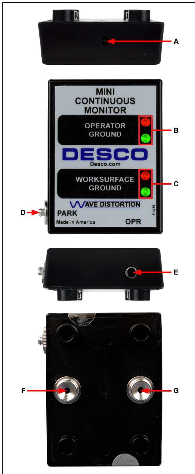
Figure 4. Mini Monitor features and components

A. Power Jack: Connect the included 24VDC power adapter here.