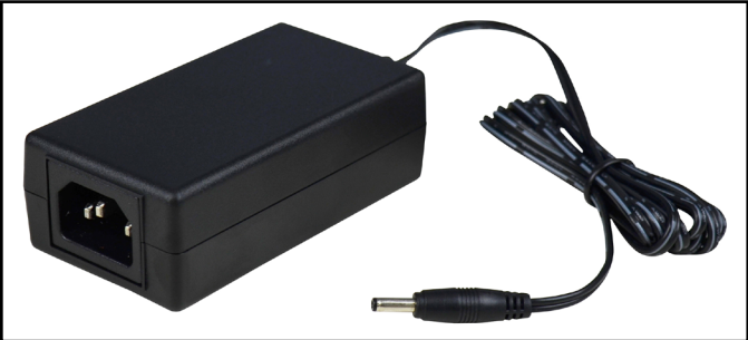
Figure 3. Universal power adapter included with the 19243 Mini Monitor

NOTE: The power cord must be purchased separately if ordering the 19243 Mini Monitor. The power cords are available as the following item numbers: