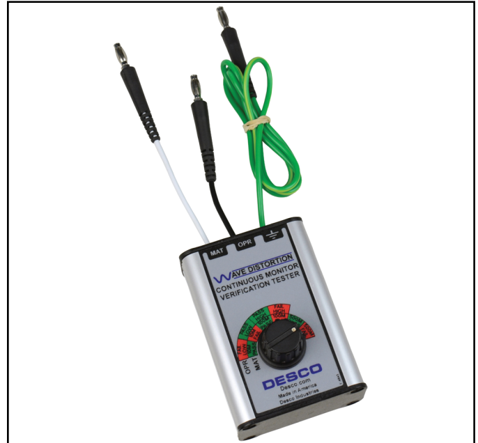
Figure 9. Desco 98221 Wave Distortion Monitor Verification Tester