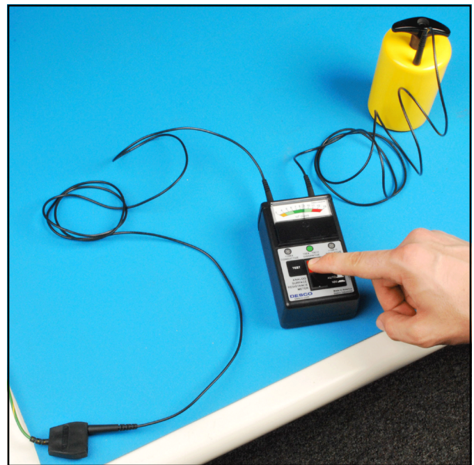
Figure 3. Using the test leads and one 5 pound electrode to measure RTG

CAUTION: If there is a current limiting resistor in the worksurface and the worksurface resistance is lower, the measurement will primarily be the resistance of the resistor. It is recommended to measure RTT particularly if the material color is black.