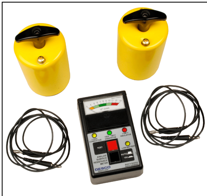
Figure 1. Desco 19784 Analog Surface Resistance Test Kit