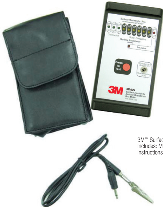
3M™ Surface Resistance Meter 625 Includes: Meter, case, cable and instructions.

Useful for audit testing required by ANSI/ESD S-20.20 and EIA 625.