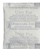
Desiccant in Tyvek® Pouch