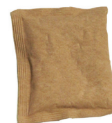
Desiccant in Kraft Pouch