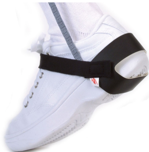
Elastic Hook and Loop Strap for Comfort and Visibility