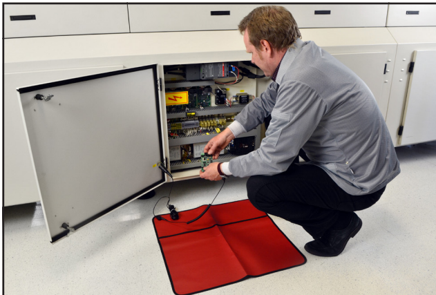
Figure 1. Proper field service ESD control.

"When neither AC equipment [Equipment Grounding Conductor] or auxiliary grounds are available, an equipotential bonding system may need to be used. In this situation, all of the items in the system are bonded together so that the charge that resides on the elements will be shared equally and therefore there will be no potential difference between the items. Once this step has been completed it is safe to handle ESD sensitive parts without inducing damage. A real life example of this is often observed in office equipment field service operations. For safety reasons the service technician will often disconnect the AC power cord which detaches the equipment from ground. In order to safely install ESD sensitive products into the equipment, it is necessary to electrically connect or bond together the service technician, the equipment frame and the ESD sensitive product. Once bonded together an ESD event will NOT occur when the technician handles the product or installs it in the office equipment." [ESD Handbook ESD TR20.20 section 5.1.3 Basic Grounding Requirements]