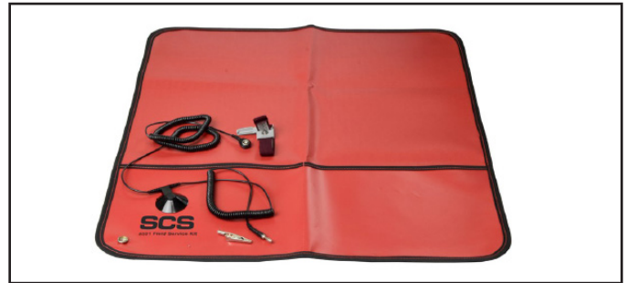
Figure 2. 8501 Field Service Kit.