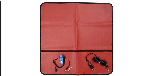
Figure 4. FSKL3RD Field Service Kit.