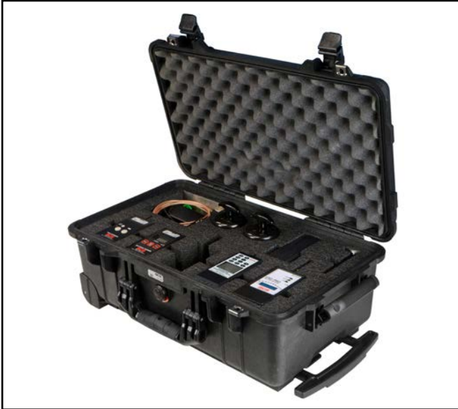
Figure 1. SCS 751 EOS/ESD Audit Kit, Standard