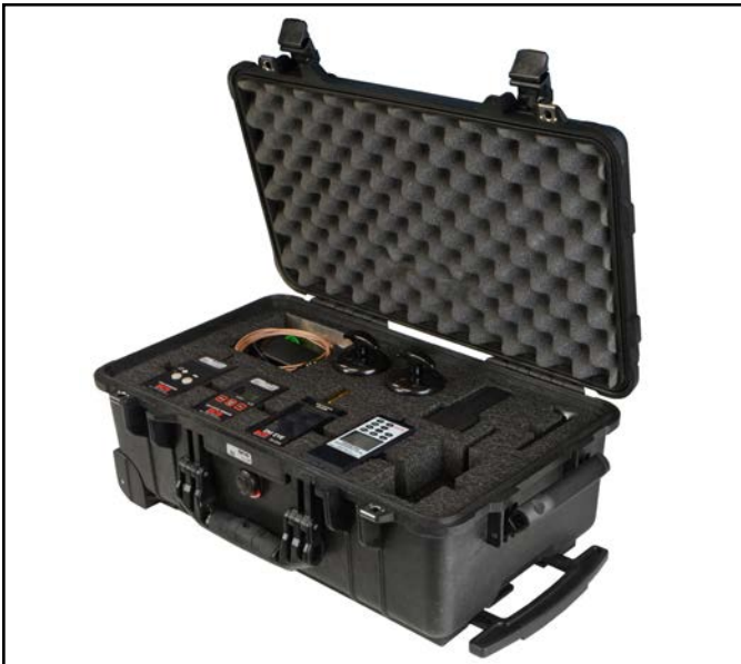
Figure 2. SCS 752 EOS/ESD Audit Kit, Premium