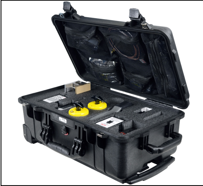
Figure 1. SCS 770045 EOS/ESD Assessment Kit