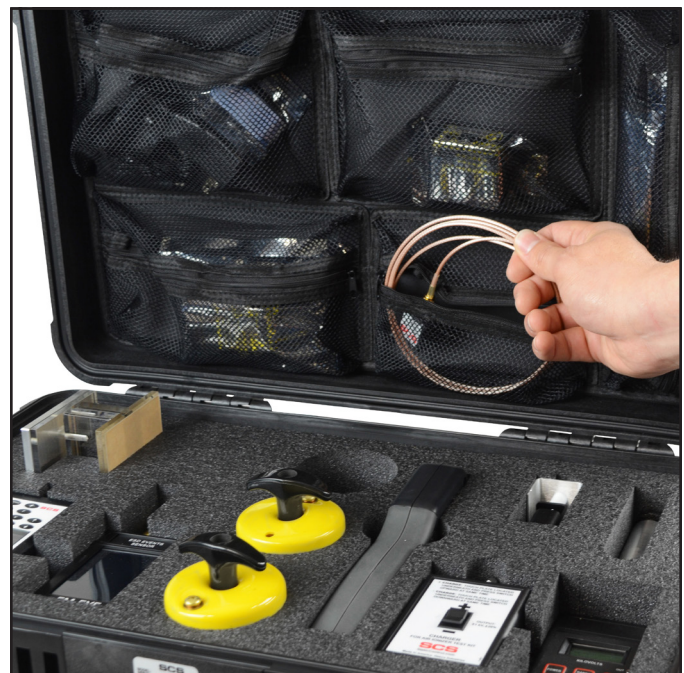
Figure 2. Using the EOS/ESD Assessment Kit's lid organizer

The ESD Program Standard ANSI/ESD S20.20 can be downloaded here: https://www.esda.org/standards/esda-documents/