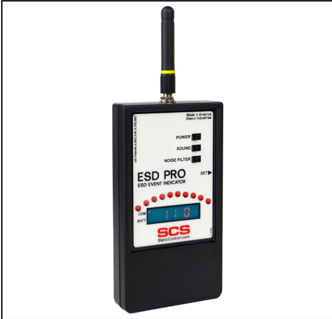
Figure 1. SCS CTM082 ESD Pro - ESD Event Indicator