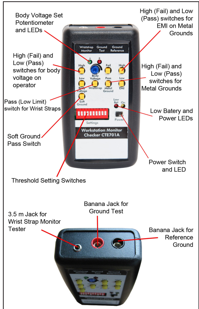
Figure 2. Workstation Monitor Checker features and components

The Workstation Monitor Checker uses a 9V alkaline battery. Make sure that a fresh battery is installed prior to performing any test. If you are not planning to use your Workstation Monitor Checker for a long time, please remove the battery from the device.