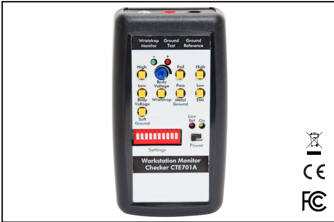
Figure 1. SCS CTE701 Workstation Monitor Checker