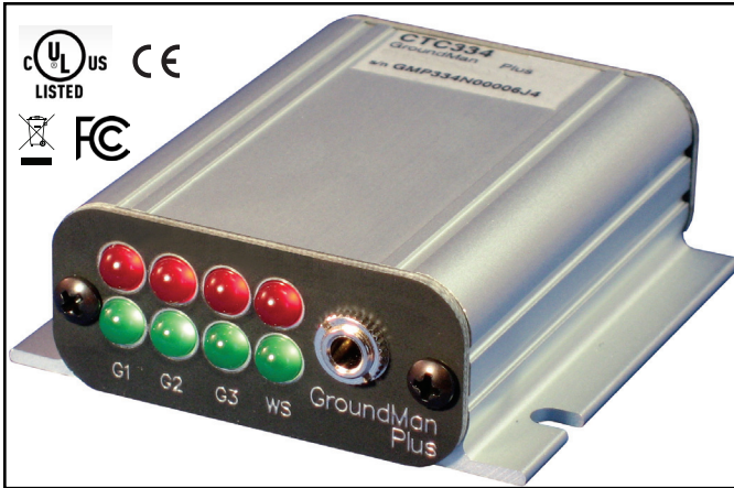
Figure 1. Ground Man Plus Ground Monitor.