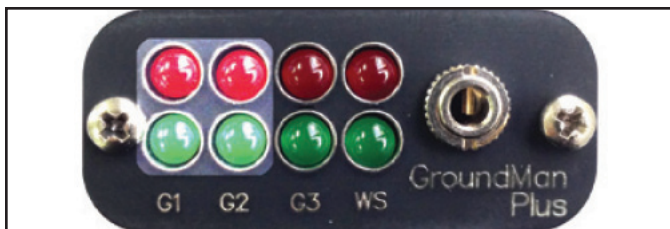
Figure 3. LED lights used to set resistance alarm level.

Verification of G1, G2 and G3 monitoring.