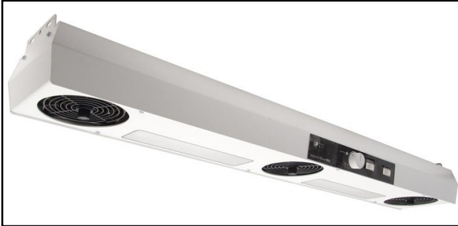
Figure 1. SCS 991A Overhead Air Ionizer