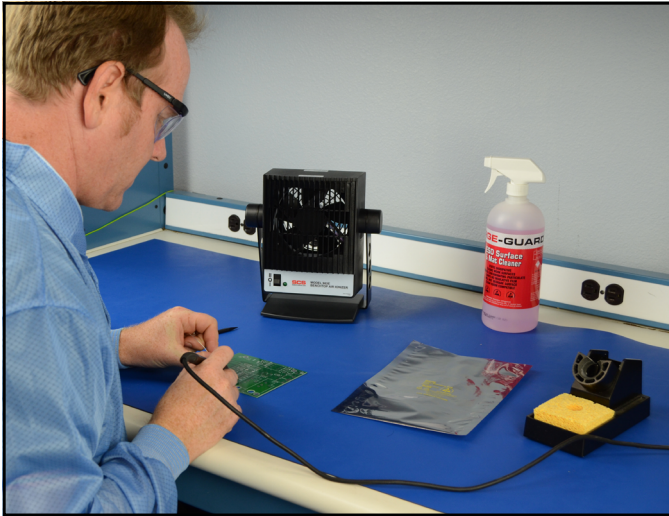
Figure 2. Using the 963E Benchtop Air Ionizer