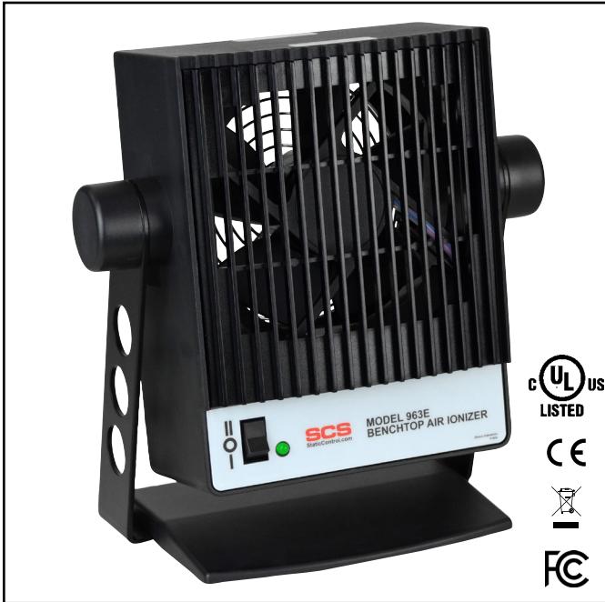
Figure 1. SCS 963E Benchtop Air Ionizer