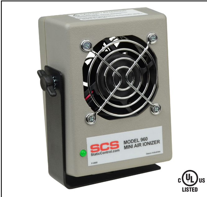
Figure 1. SCS 960 Mini Air Ionizer