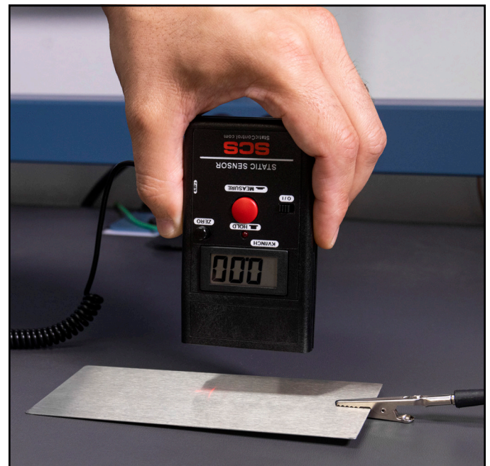
Figure 6. Pointing the Static Sensor to a grounded surface

Slide the power switch to the right to power the Static Sensor. Point the top of the Static Sensor approximately 1 inch (2.5 cm) away from a grounded metal surface. Proper spacing is indicated when the two red bullseyes emitted LED range indicator become centered on top of each other. Turn the rotary zero knob until the Static Sensor's display reads 0.00.