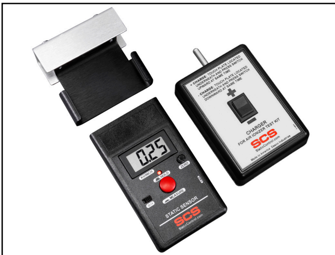
Figure 2. SCS 770717 Air Ionizer Test Kit