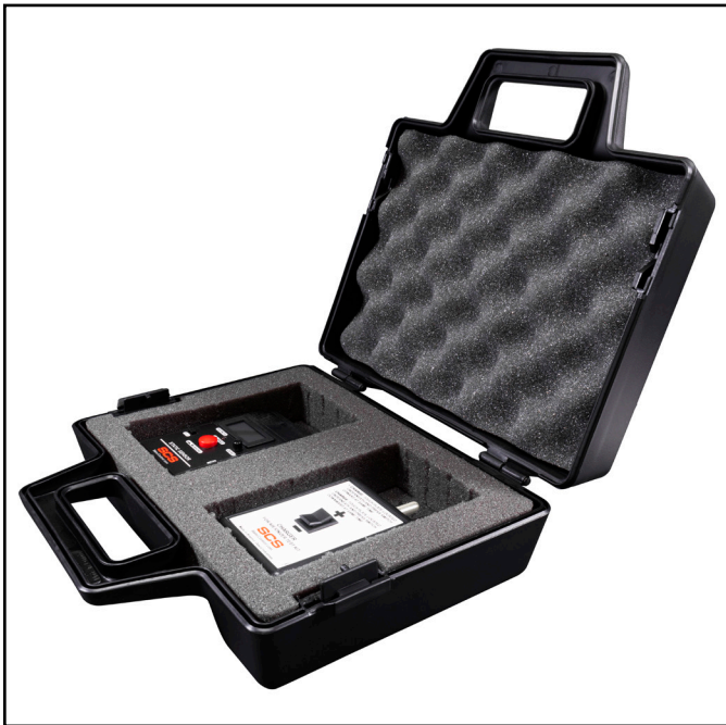
Figure 3. Air Ionizer Test Kit and Carrying Case