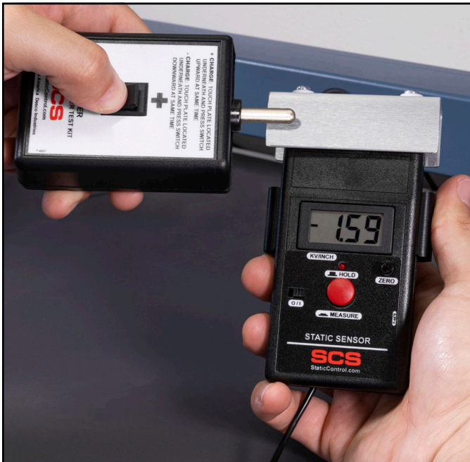
Figure 10. Using the Charger to apply a charge onto the Conductive Plate

NOTE: A ground path must be provided between the touch plate of the Charger and the ground reference of the Static Sensor. This is normally provided by holding the Charger in one hand and the Static Sensor with Conductive Plate in the other.