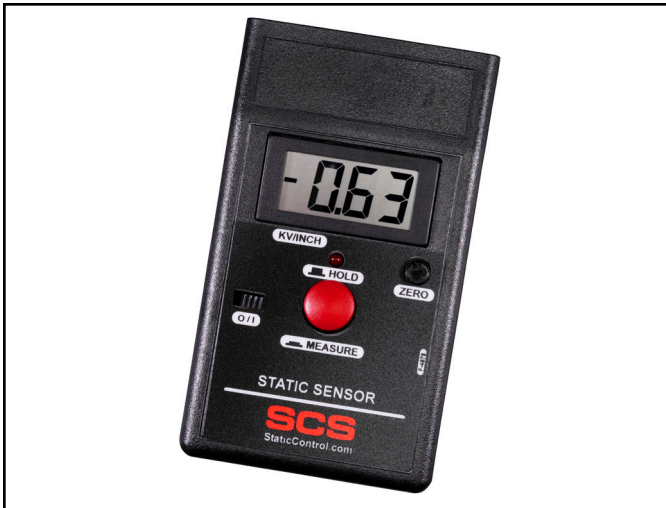
Figure 1. SCS 770716 Static Sensor