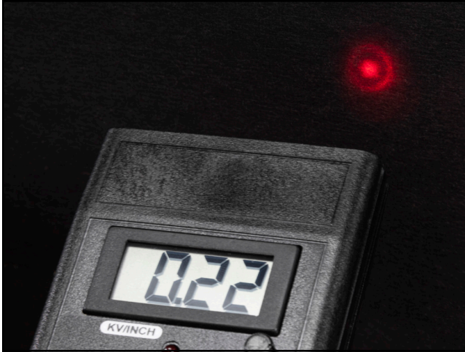
Figure 7. Aligning the two bullseyes emitted by the LED range indicator