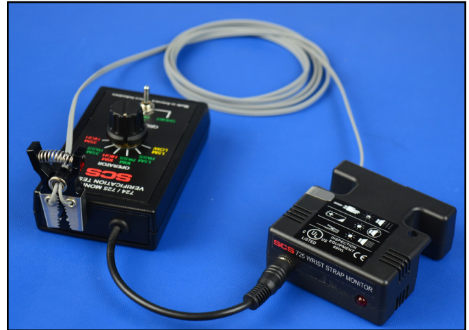
Figure 4. Using the Verification Tester with the 725 Portable Wrist Strap Monitor