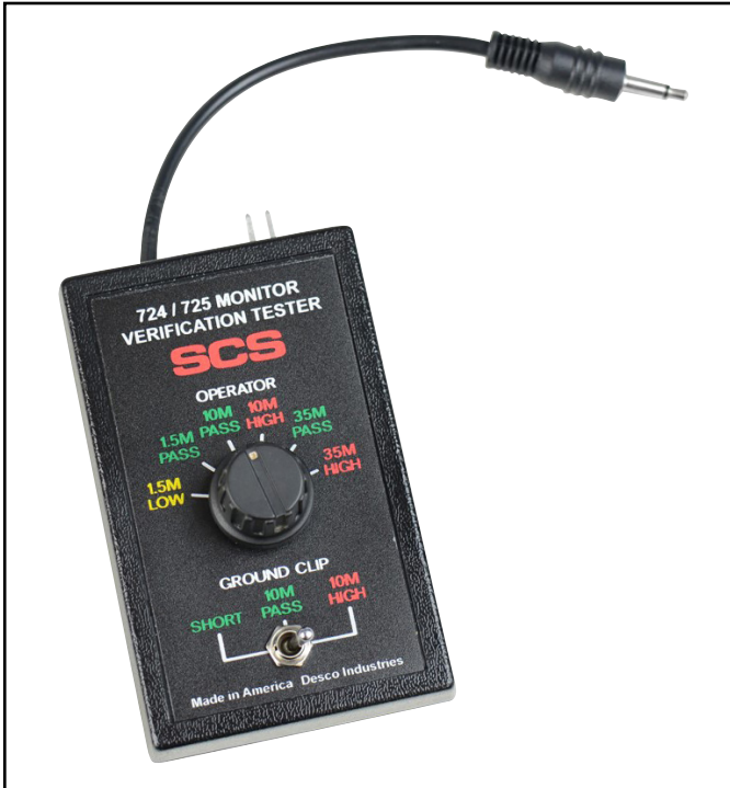
Figure 1. SCS 770065 Verification Tester