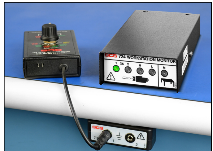
Figure 3. Using the Verification Tester with the 724 Workstation Monitor