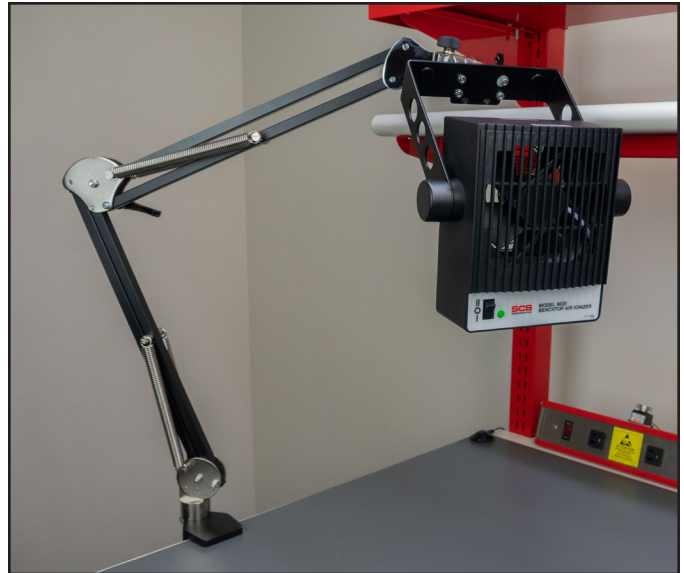
Figure 6. Using the Benchtop Ionizer Boom Arm with the 963E Benchtop Air Ionizer