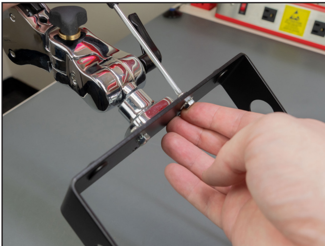
Figure 5. Securing the boom arm to 963E Benchtop Air Ionizer's metal bracket