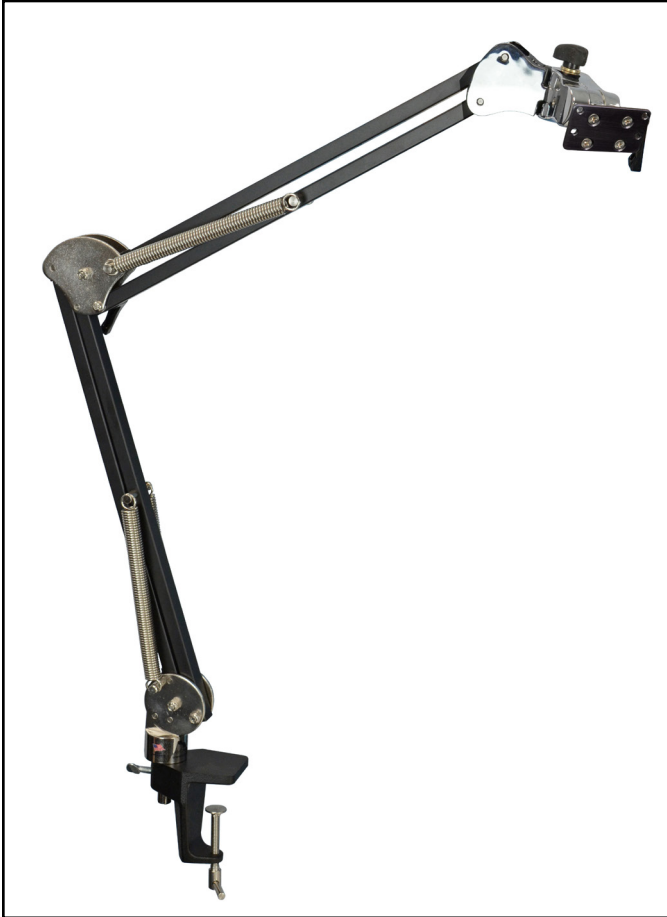
Figure 1. SCS 770047 Benchtop Ionizer Boom Arm