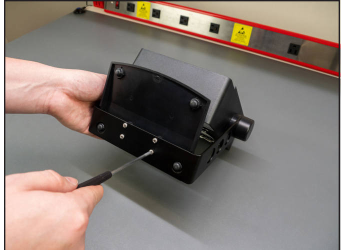
Figure 2. Removing the 4 screws underneath the 963E Benchtop Air Ionizer