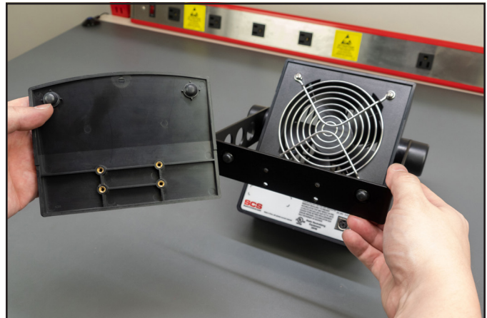
Figure 3. Removing the plastic base plate from the 963E Benchtop Air Ionizer