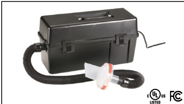
Figure 1. 497AJW Small Particle Collection Vacuum.